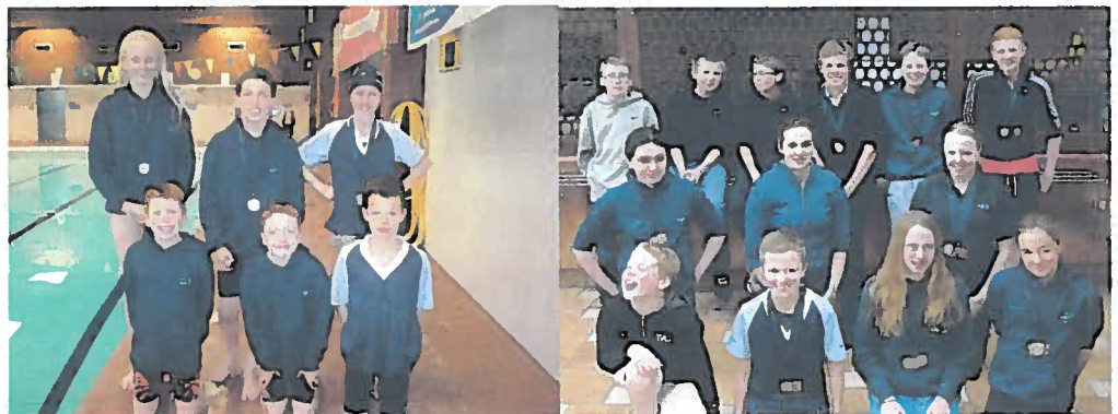
North Ayrshire Distance Meet Junior Squad