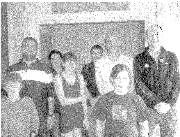
Some parents from Auchendarvie Pool who took part

An amazing almost £1500 was raised by twenty parents from North Ayrshire Amateur Swimming Club (NAASC) for Charity last month split between Sports Relief and NAASC funds. Children from the Club were given a form and asked to nominate parents to Swim in the First Lane for Sports Relief/Club funds. For some parents this was more of a dilemma than others. How you could refuse – when nominated by your child? This meant swimming in the beginners lane while their children were training. Will I make a fool of myself? Will I be able to last the pace? For other swimmers – not a chance were they going to even ask their parents to make a fool of themselves!