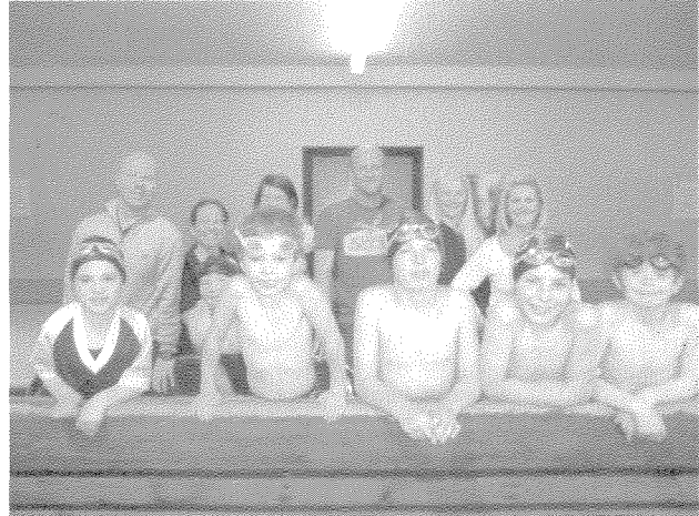
Some parents from Largs pool who participated

okay surely? The session started off with basic streamlining – how to push off from the wall, basic techniques of front crawl and the other strokes and then what they had not bargained for – was the drills and kick and pull (using floats) and at the very end to really earn their money - a bit of Butterfly!. Some parents struggled with